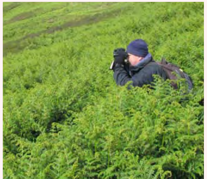
British Trust for Ornithology