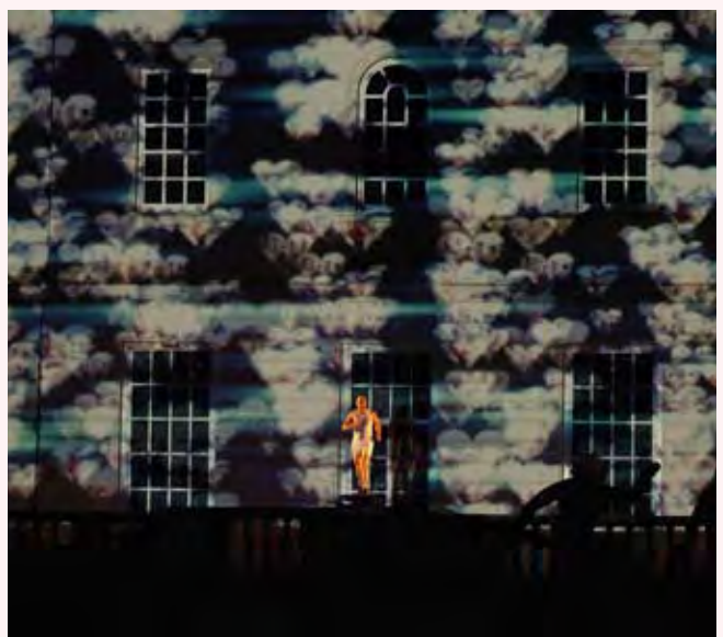
Greenwich & Docklands Festivals