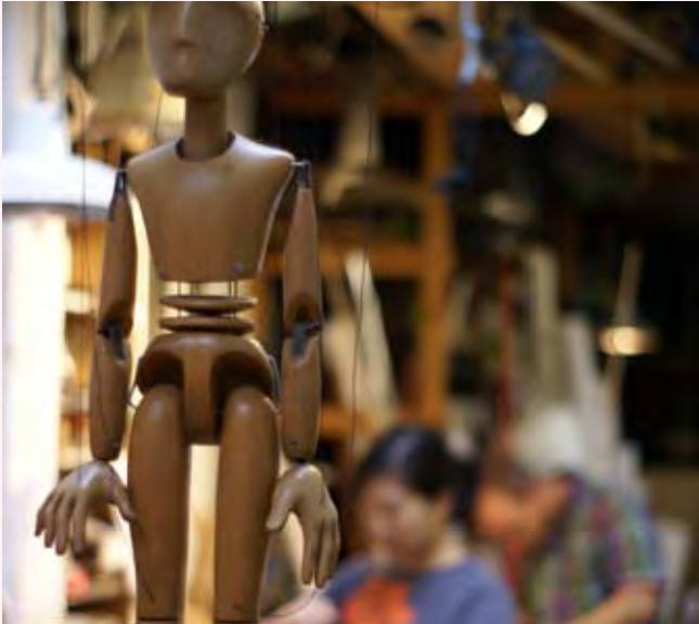
Little Angel Theatre