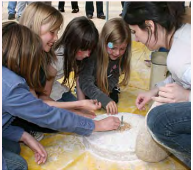
Council for Scottish Archaeology