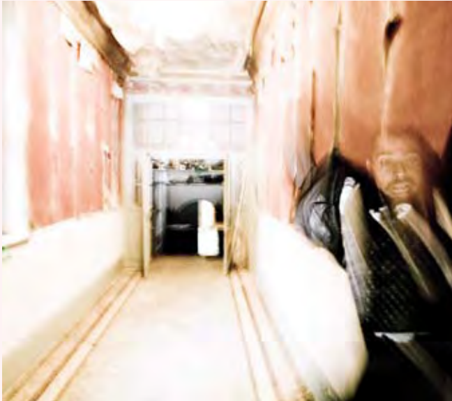
Battersea Arts Centre