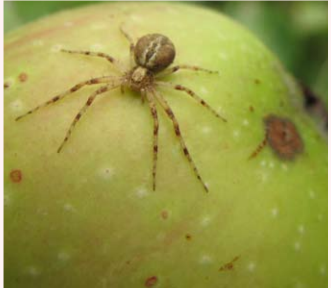
People's Trust for Endangered Species