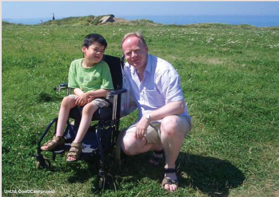
UnLtd. Cool2Care project

Further investments of £3.1m have been approved by the Finance Fund Panel and are subject to the agreement of terms at 31 December 2009, making a total commitment of £4.2m at year end.